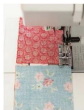
Chain piece rectangle sets into pairs.

Note: Contrast does not necessarily mean light and dark fabrics. For example, a red and a green with the same value still have great contrast.