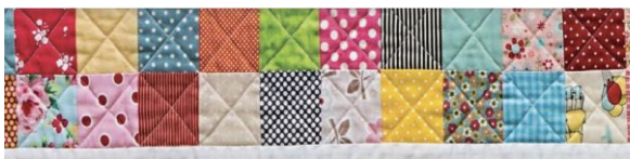
Row 1: Simple Patches