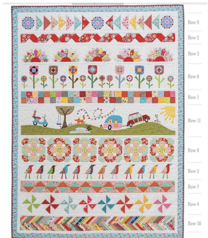
Piper's Girls' Row Quilt